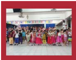
This is from the Christmas production "Where in the World is Christmas?" All the students did great!

The brokenness and darkness is real in that red light area. The goal of these outreach nights is to find women who are wondering about leaving that life and to hopefully establish relationships outside of the bar. Through this ministry, English classes are offered once a week, and this is one thing I and others promote this on outreach night. This opportunity the Lord has given me has been a very blessed, but humbling experience.