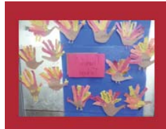
These are our thankful turkeys we made while talking about what we are thankful for.

I have been serving with a ministry I mentioned in my last newsletter for a month or so now. It is one that helps women in sex prostitution and in the red light areas. I learned of this ministry through my church here in Bangkok because it is one of the ministries they support. I volunteer with them by going to their outreach nights, typically on Friday night. During outreach, we (a team of 3-4 people, some of who work for the organization) go to a bar to talk to some of the women there. While for me there is a language barrier, most women can speak some English. I have been blessed by having good conversations with a few girls, even through their broken English. Some barely have an education, while some are working there to pay for a college degree.