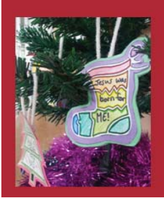
"Jesus was Born for Me" ornaments decorated by my students to remind them that Jesus came to earth for them.

I have been serving with a ministry I mentioned in my last newsletter for a month or so now. It is one that helps women in sex prostitution and in the red light areas. I learned of this ministry through my church here in Bangkok because it is one of the ministries they support. I volunteer with them by going to their outreach nights, typically on Friday night. During outreach, we (a team of 3-4 people, some of who work for the organization) go to a bar to talk to some of the women there. While for me there is a language barrier, most women can speak some English. I have been blessed by having good conversations with a few girls, even through their broken English. Some barely have an education, while some are working there to pay for a college degree.