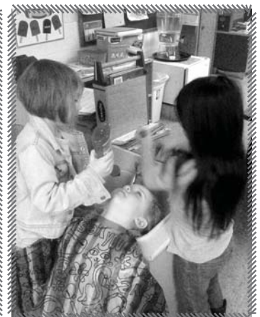
Busy day at St. John's Preschool Hair Salon!