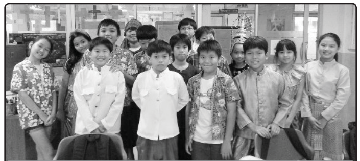
This is a picture of my students during the Songkran celebration (Thai New Year) at school. Students are in Thai traditional dress and Songkran shirts (flowered shirts). We had a 2 week break from school for this holiday.