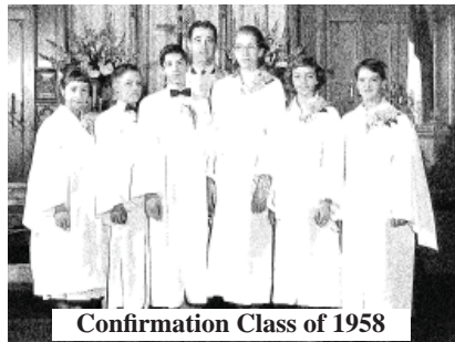
Confirmation Class of 1958

They keep trickling in – one picture two weeks ago, three pictures last week – people are finding pictures of when they or family members were confirmed here at St. John's! We're scanning each picture brought in for our records, and hope to put them on display in the near future! Original