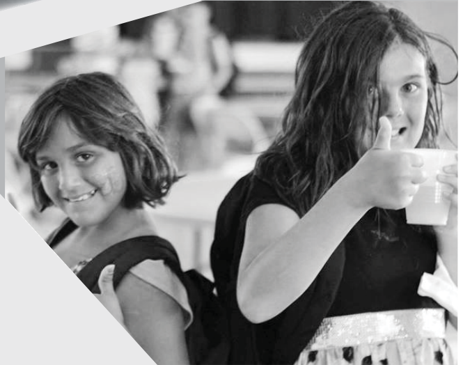
Two happy recipients at a previous Book Bag Bash

Come Hear the Reason we're Inspired to Serve Together