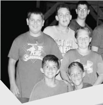
Junior Youth Fellowship

Come Hear the Reason we're Inspired to Serve Together