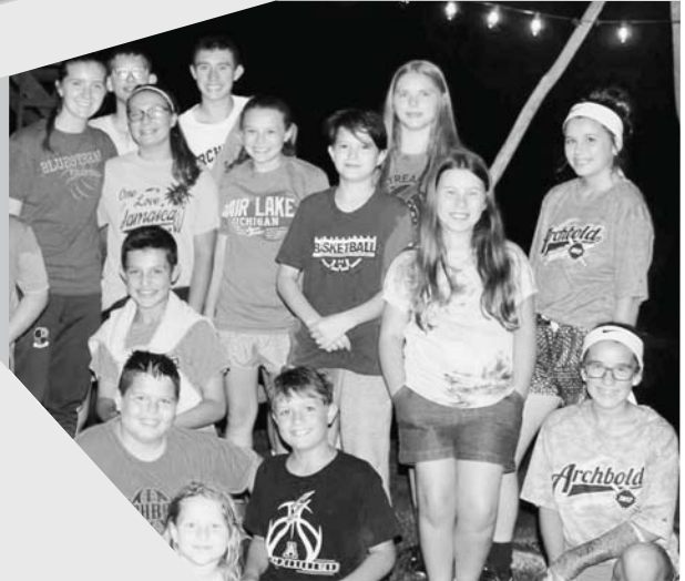
Junior Youth Fellowship

Come Hear the Reason we're Inspired to Serve Together