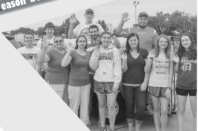
SYF Mission Trip Participants

Come Hear the Reason we're Inspired to Serve Together