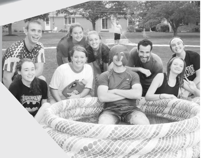
Several Senior Youth Fellowship Participants

Come Hear the Reason we're Inspired to Serve Together