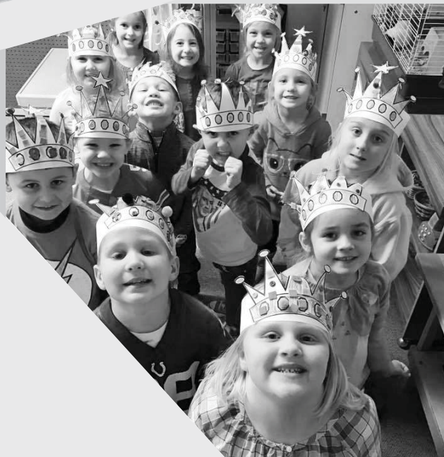
LOGOS Pre-K & Kindergarten Youth

Come Hear the Reason we're Inspired to Serve Together