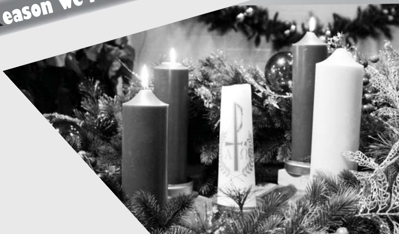
Hope, Peace, Joy

Come Hear the Reason we're Inspired to Serve Together