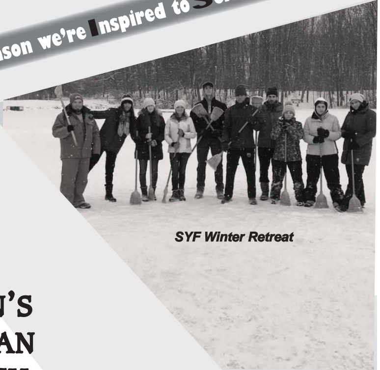
SYF Winter Retreat

Come Hear the Reason we're Inspired to Serve Together