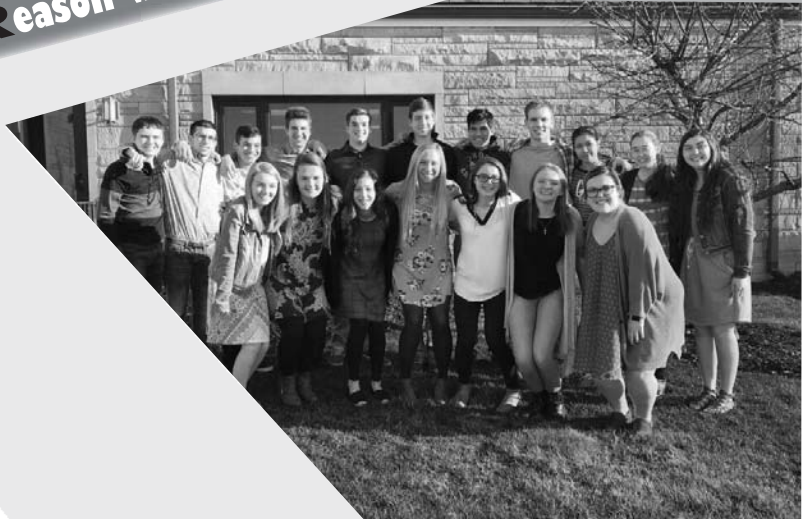
SYF Easter Morning

Come Hear the Reason we're Inspired to Serve Together