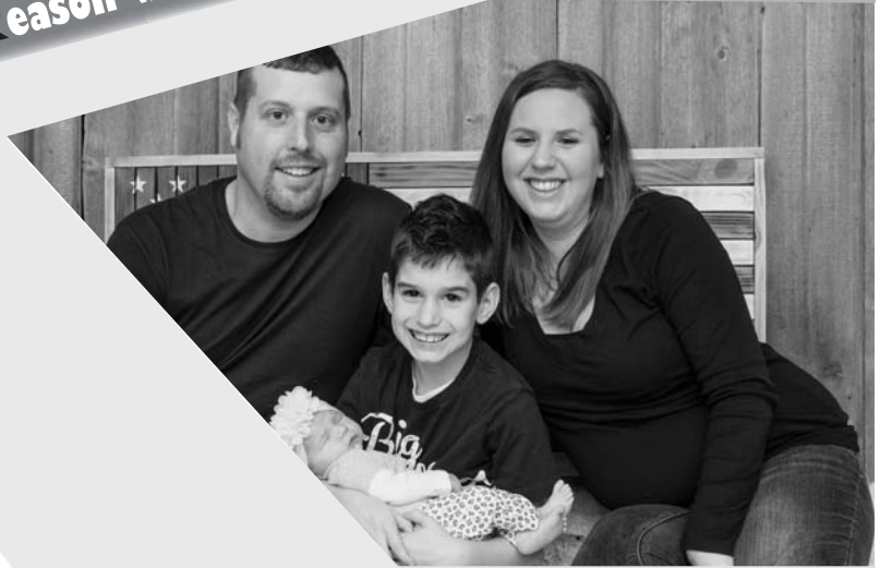
The Helberg Family

Come Hear the Reason we're Inspired to Serve Together