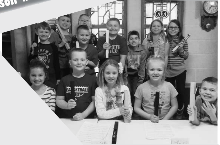
Children's Chime Choir

Come Hear the Reason we're Inspired to Serve Together