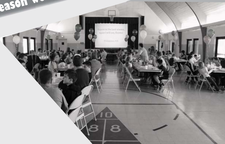
LOGOS Celebration Banquet

Come Hear the Reason we're Inspired to Serve Together