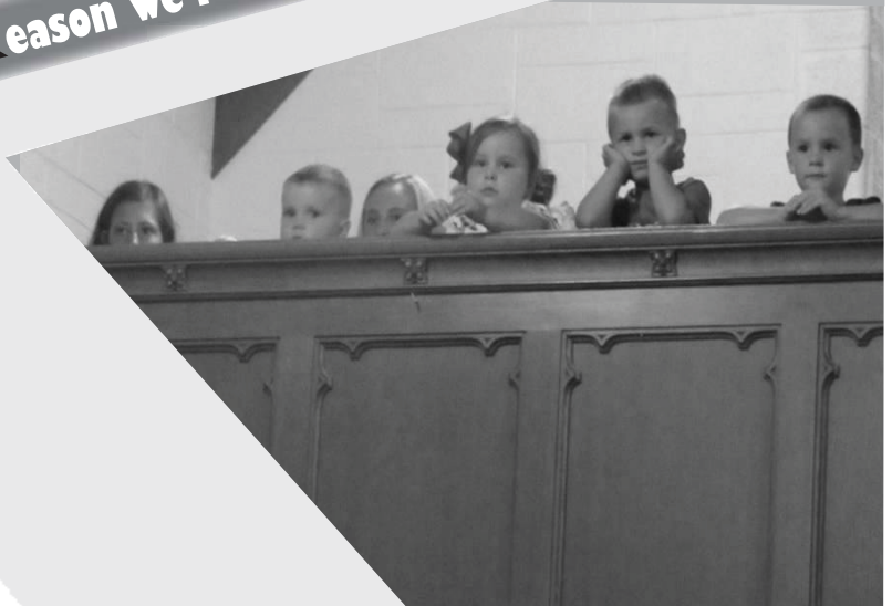
VBS Nursery Children

Come Hear the Reason we're Inspired to Serve Together