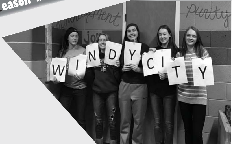
Youth Mission Trip to Chicago

Come Hear the Reason we're Inspired to Serve Together