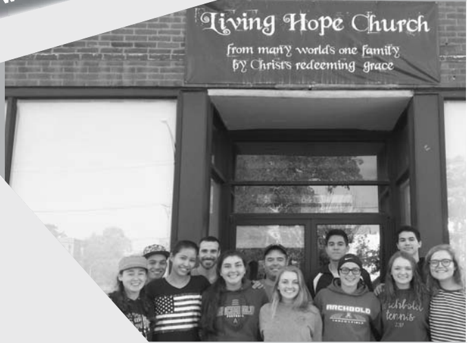
2018 Chicago Youth Mission Trip

Come Hear the Reason we're Inspired to Serve Together