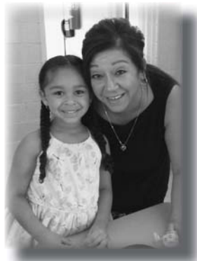
Enjoying the day with our Grandparents and getting ready for Graduation.