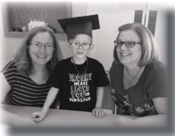
The cap fits perfectly!

Preschool is officially over for the summer, but we have lots of happy, fun memories to take with us! We made new friends, learned about God, and had special nights with parents and grandparents. Have a great summer and we can't wait to bring our cheerful smiles back in the fall!