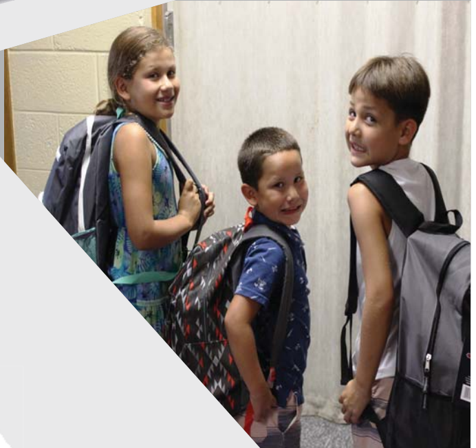
Book Bag Bash

Come Hear the Reason we're Inspired to Serve Together