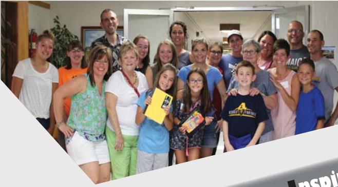
Book Bag Bash Bunch

Come Hear the Reason we're Inspired to Serve Together