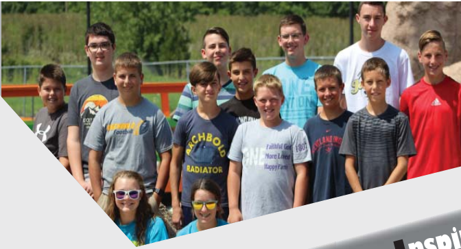
JYF Fun Day

Come Hear the Reason we're Inspired to Serve Together