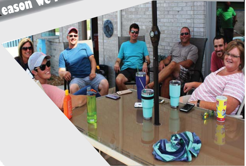
JYF Fun Day Leaders

Come Hear the Reason we're Inspired to Serve Together