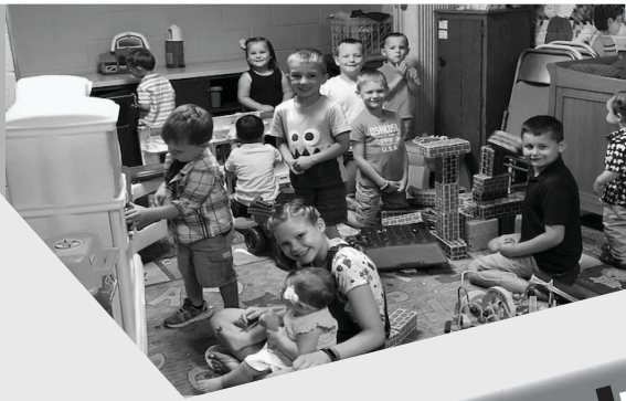
Preschool Sunday School Class

Come Hear the Reason we're Inspired to Serve Together