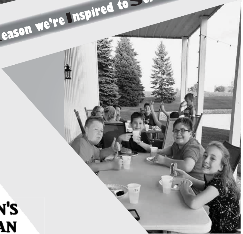
JYF Fall Outing

Come Hear the Reason we're Inspired to Serve Together