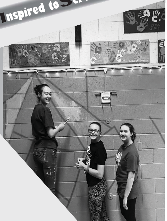
Painting the SYF Room

Come Hear the Reason we're Inspired to Serve Together