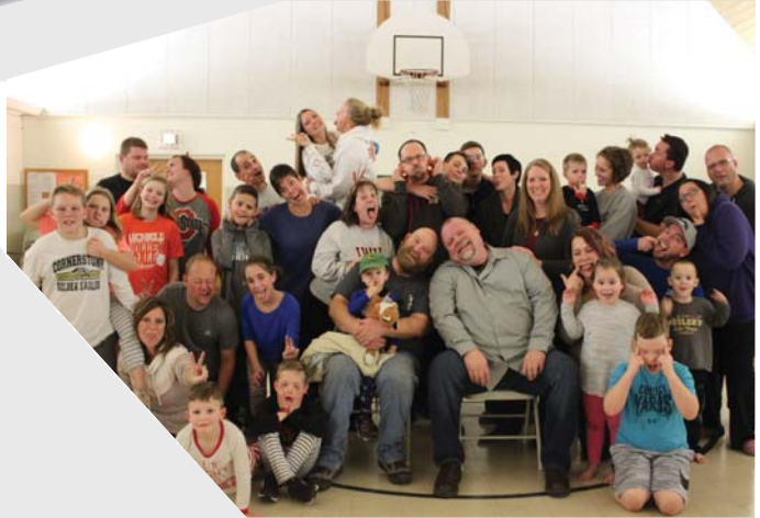
Couples Small Group Christmas Party

Come Hear the Reason we're Inspired to Serve Together