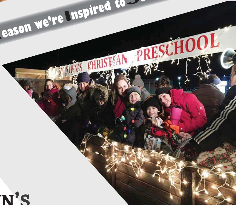
Preschool Christmas Parade

Come Hear the Reason we're Inspired to Serve Together