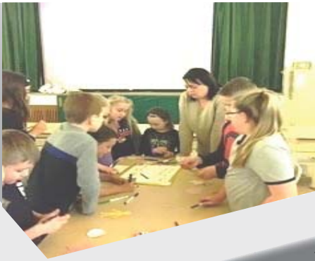
LOGOS Poster Contest

Come Hear the Reason we're Inspired to Serve Together