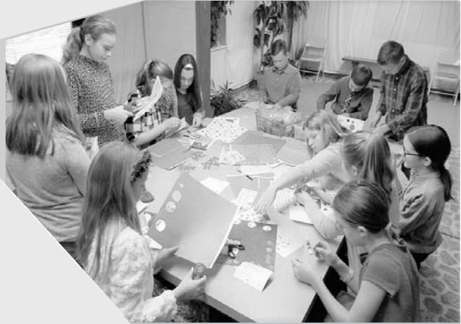
Faith Village - Making Valentine's for Shut-ins

Come Hear the Reason we're Inspired to Serve Together