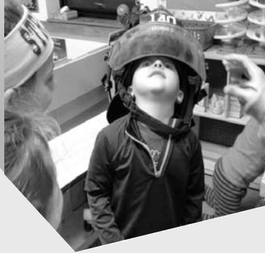
Preschool Fire Safety

Come Hear the Reason we're Inspired to Serve Together