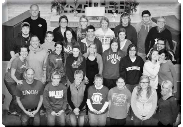
2013-14 Life Planning Mentors & Youth

The next Life Planning time will be on March 12th at 7PM. Mentors and youth will have opportunity to discuss what Lent means to them, and they will also get into some scripture about our need for Jesus.