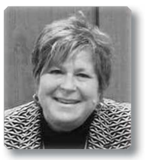
Deb Rupp Elder Nominee