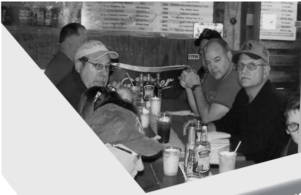
Back Bay Mission Trip

Come Hear the Reason we're Inspired to Serve Together