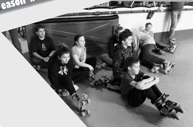
JYF Skating Party

Come Hear the Reason we're Inspired to Serve Together