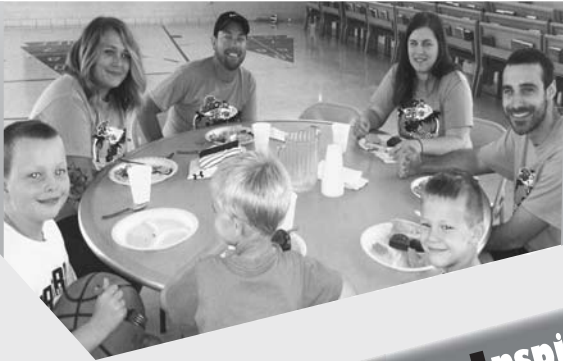
Enjoying VBS Fellowship

Come Hear the Reason we're Inspired to Serve Together