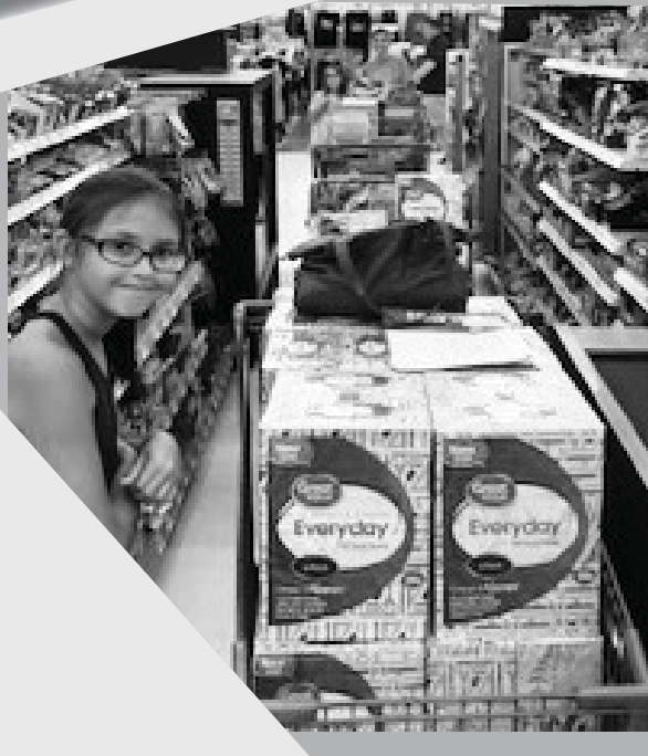
Shopping for the Book Bag Bash

Come Hear the Reason we're Inspired to Serve Together