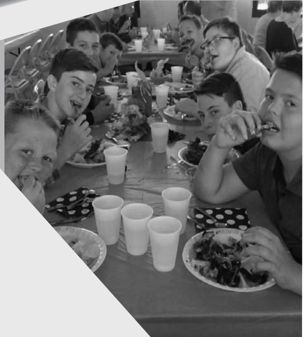
Enjoying the Delicious Chicken!

Come Hear the Reason we're Inspired to Serve Together