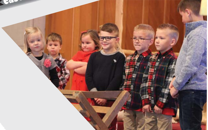
Children's Christmas Musical

Come Hear the Reason we're Inspired to Serve Together