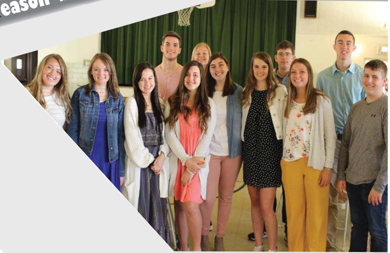
SYF on Easter Morning

Come Hear the Reason we're Inspired to Serve Together