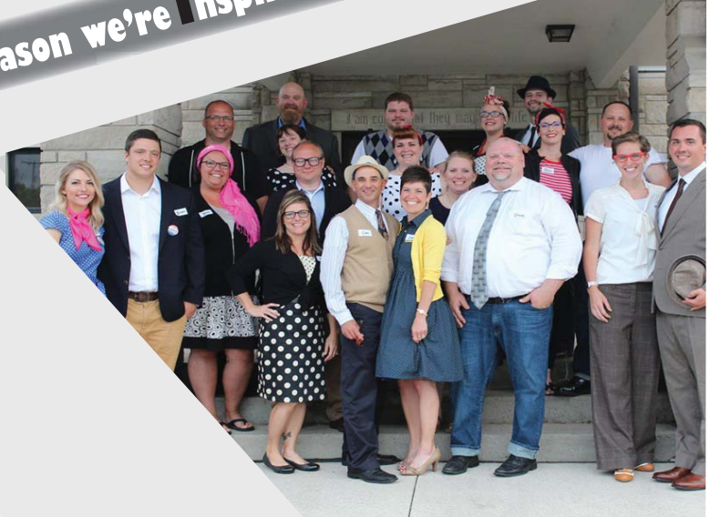
Couple's Small Group "Murder Mystery" Night

Come Hear the Reason we're Inspired to Serve Together