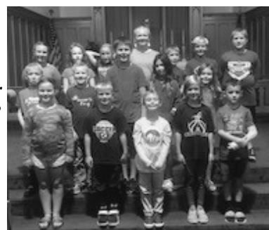
Logos Junior Choir rehearsal on 10/13

Couples Small Group began a marriage study titled, "Grace Filled Marriage" this past month. The next meeting is scheduled for December 12th at 6:00 p.m. in the Fireside Room. All are welcome! Please join us!