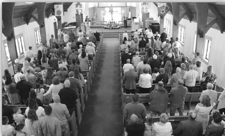
Easter Sunday in the Sanctuary