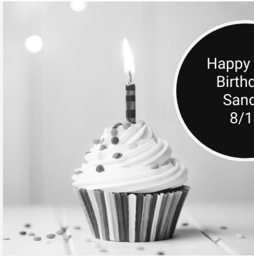
Happy 80th Birthday, Sandy! 8/18