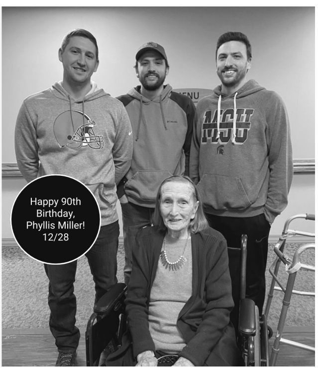
COME HEAR THE REASON WE'RE INSPIRED TO SERVE TOGETHER

We are a community of faith founded upon God's Holy Word, preaching salvation through believing in Christ as our Savior. We seek to live in God's truth, being obedient to His Word and following in His ways.